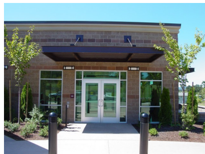
Senior Center Entry