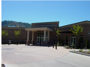
Main Entry Portico

Winston Area Community Partnership, (WACP) raised over $4,000,000 in the Winston Area to build a new community center. The center was to replace the antiquated senior center which had been part of Winston Community Park for over 50 years. The new facility would be located in the park on property donated by the City of Winston.