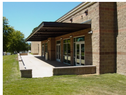
Patio @ Meeting Rooms